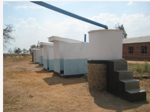
Several toilet options with different technology and cost.

-HAPA has trained local technicians who generate small funds by selling their expertise through helping the community in the construction of their own latrines.