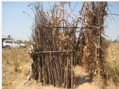
Old toilets before the project started in Mampando village.

The project seeks to improve hygiene and sanitation practices and provide education around the importance of these practices in the reduction of preventable diseases such as malaria or diarrhoea, one of the leading causes of death in children worldwide.