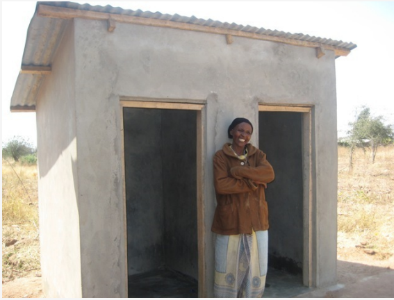
A safe toilet constructed by one of the village families.

The project was successfully implemented and handed over to the community in early 2015. Among the achievements are: